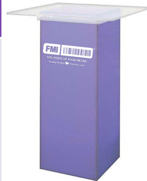
Pedestal is 42" tall with a table space of 30" x 30"

*Sponsorships are available ONLY to FMI Associate Members