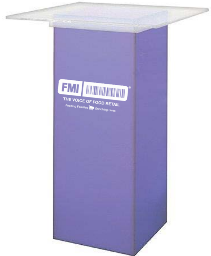
Sample branded pedestal table

Looking for a customized opportunity ? Let us help build something that is unique to your needs. Call or email us today!